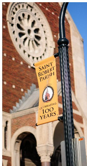
Centennial banners fly on light poles on Capitol Drive during 2012.